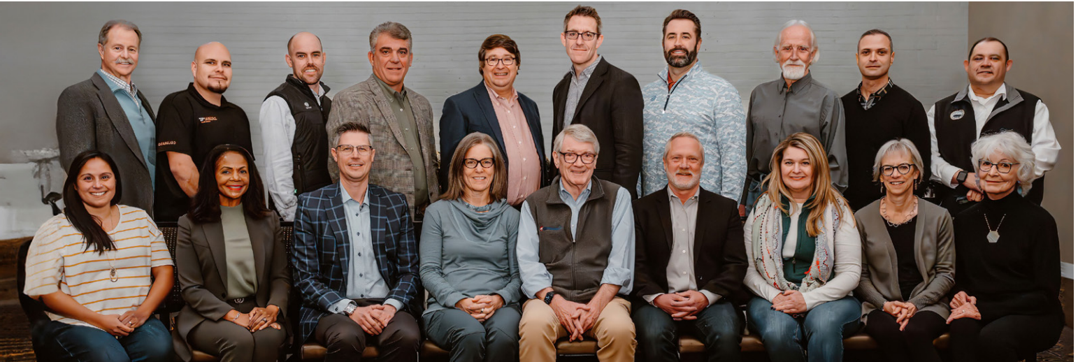
The FRPR District Board of Directors.