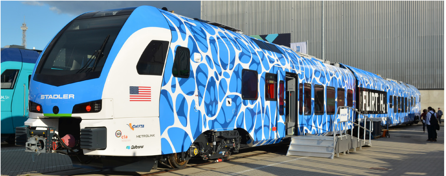
The FLIRT H2 Train, a hydrogen-and battery-powered train, developed by Stadler Rail.