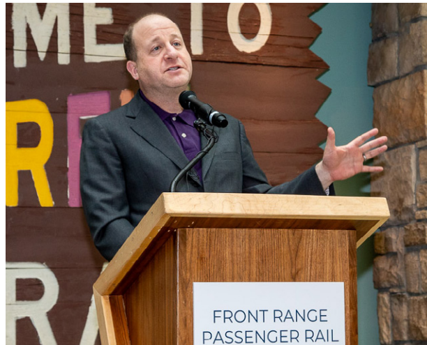
Governor Polis addresses attendees at the celebration of the FRPR District's acceptance into CIDP.

Colorado enters CIDP ahead of the curve – many other states are at the starting line when it comes to developing new passenger rail corridors while Colorado began working with the FRA and developing its Service Development Plan (SDP) in 2020. The SDP is the second step in the CIDP. With strong state support, the unprecedented funding opportunities established through the Bipartisan Infrastructure Law make this a once-in-a-lifetime opportunity to build, operate and maintain passenger rail along Colorado's Front Range.