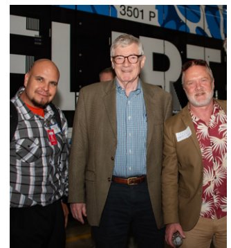
FRPR District directors were excited to ride a first-of-its-kind hydrogen-and battery-powered train at an event hosted by Governor Polis at the Transportation Technology Center in Pueblo in September.